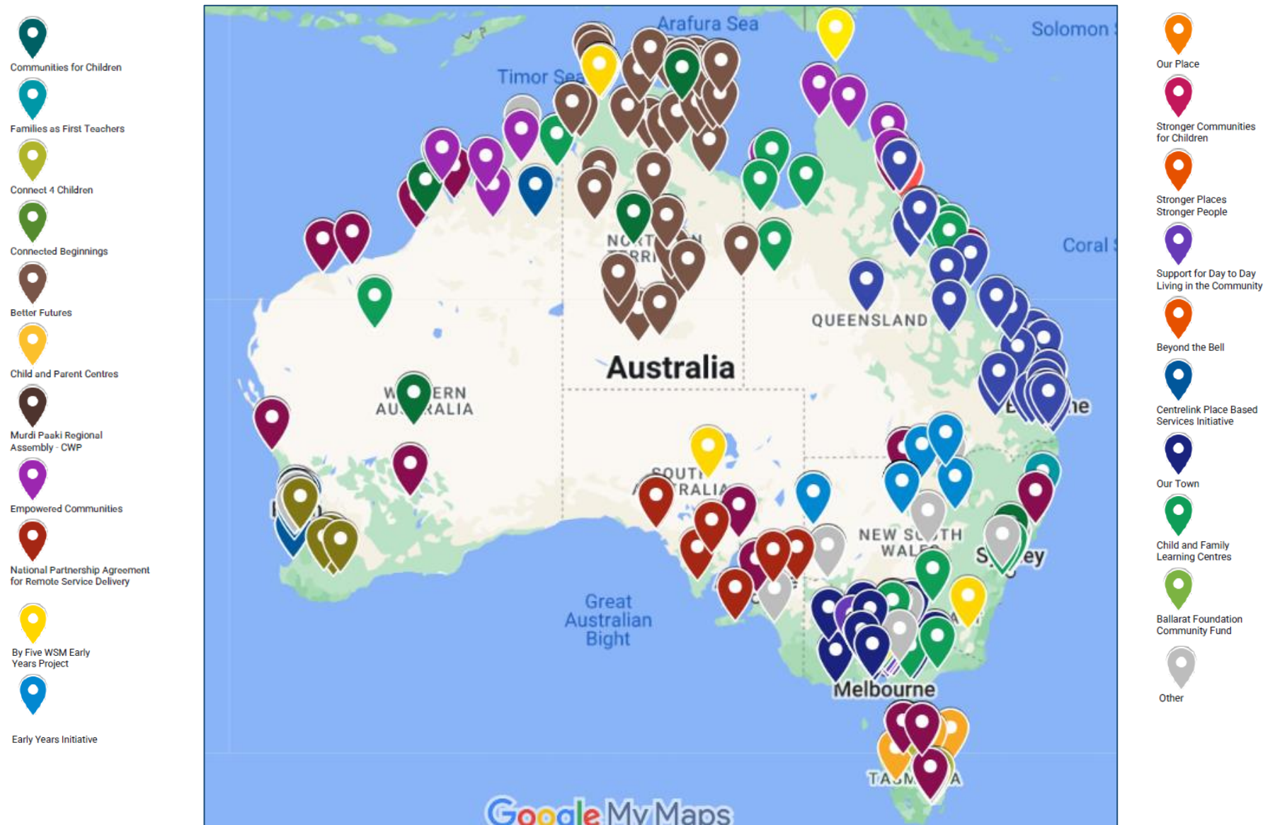
Figure 1: Selection of place-based initiatives active across Australia